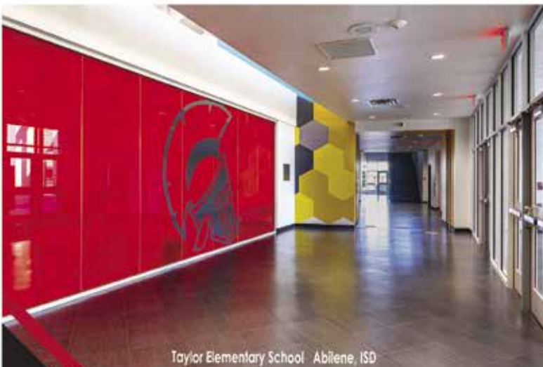
Taylor Elementary School Abilene, ISD